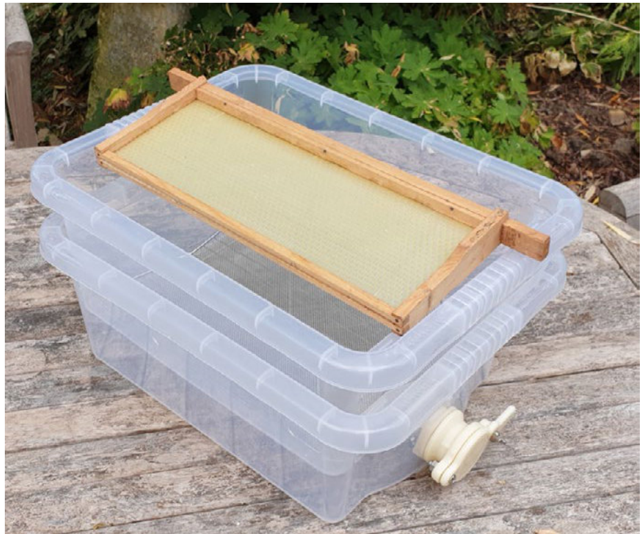
Voilà – a reasonably cheap uncapping tray.