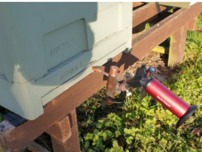
Drill a hole in the upstand of the inspection board.