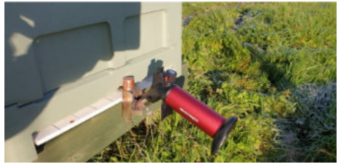
It works fine with a regular Correx inspection board as well.