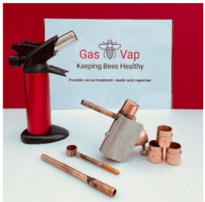
The Gas Vap

Some 3-4 years ago, however, a clever chap came up with the idea of the Gas Vap ... so simple, obvious, transportable and cheap to make ...I wish I had thought of it. It won prizes at the National Honey Show, in fact.