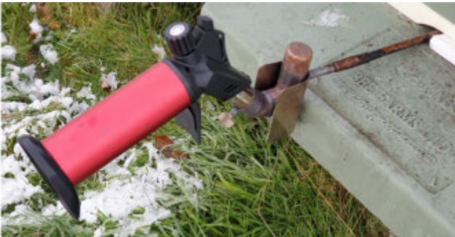
Problems at the landing board

If you have a regular Correx inspection board...same thing!