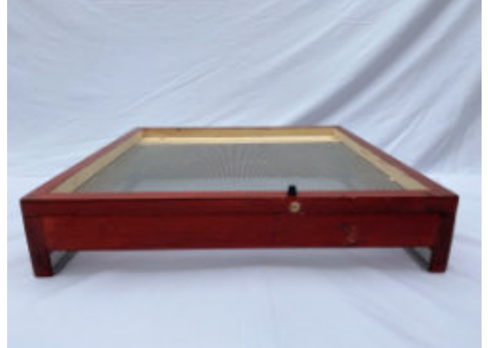
Final product, painted and ready to go.

The next 'improvement' is for those who sublimate using a Gas-Vap device. Instead of sublimating from the varroa tray (and all the issues involved in sealing the gap), drill an 8mm hole in the wooden edging above the mesh. When not in use, this hole can be sealed with either gaffer tape or an appropriate sized cover cap. This method does not disturb the bees and all of the sublimation fumes are dispersed throughout the hive with none adhering to the mesh.